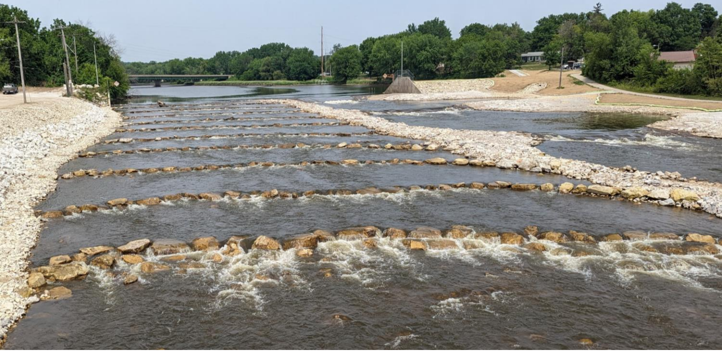
Pinicon Ridge Dam Modification (Central City, Iowa) Owner: Linn County Conservation