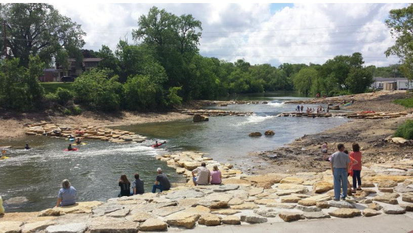
Wave Pools (Charles City, Iowa)