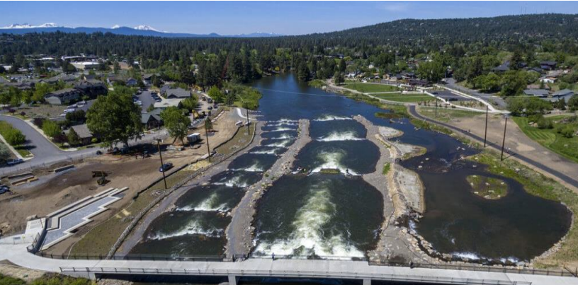
Fish Passage, Wave Pools & Flood Channel (Bend, Oregon)