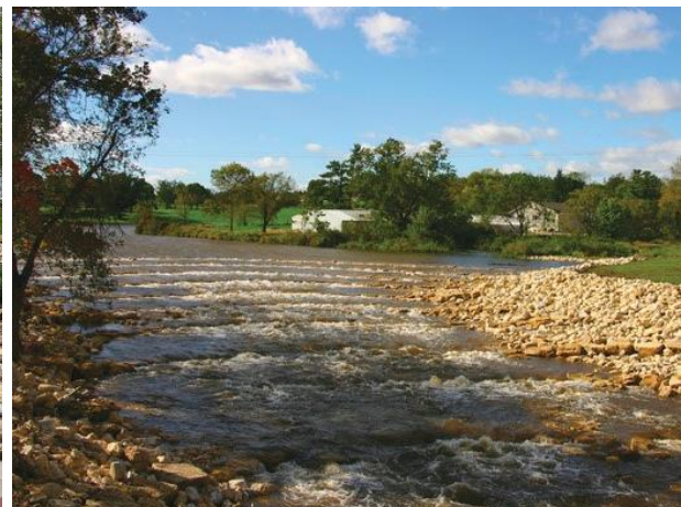
Rock Arch Rapids (Cresco, Iowa)