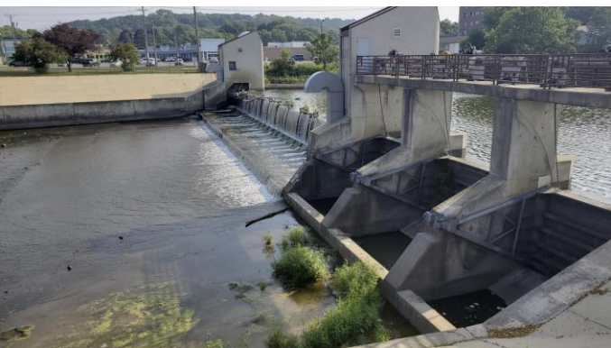
EXISTING SILVER LAKE DAM