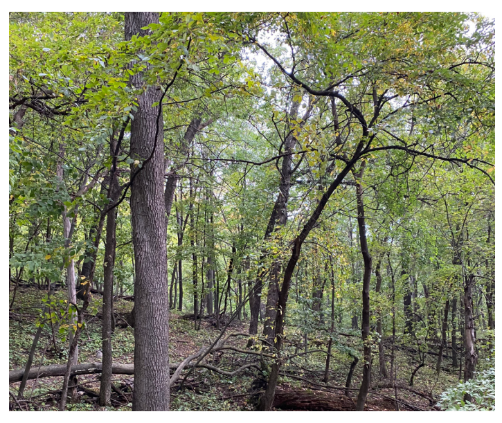
The Grand Lake (Brink) conservation easement in Stearns County, which was completed in June 2023 under Phase 2 this program, protects 134 acres. The property consists predominantly of hardwood forest, along with restored prairie and wetlands scattered throughout the property.

The Sauk River (Kotschevar, A & J) conservation easement in Stearns County, which was completed in June 2023 under Phase 2 and 4 of this program, protects 65 acres and over 4,500 feet of shoreline along the Sauk River. The property is adjacent to two other MLT conservation easements, creating a complex of over 169 acres of protected land, which protects approximately 14,000 feet of Sauk River shoreline.