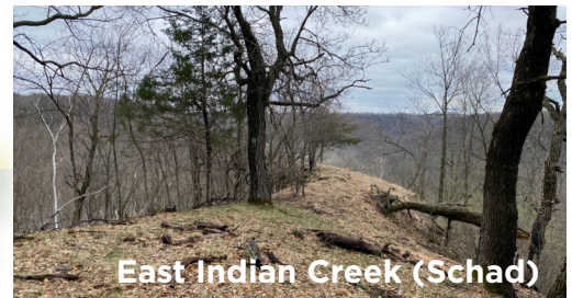
East Indian Creek (Schad)