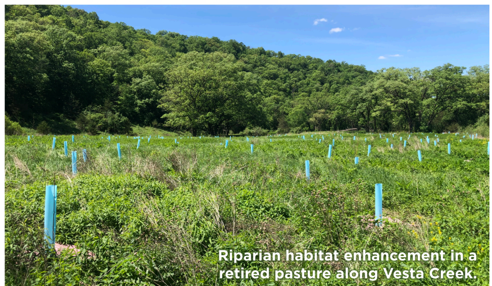
Riparian habitat enhancement in a retired pasture along Vesta Creek.

Trout Unlimited and The Nature Conservancy are undertaking stream restoration projects on Maple and Vesta Creeks on Choice WMA.