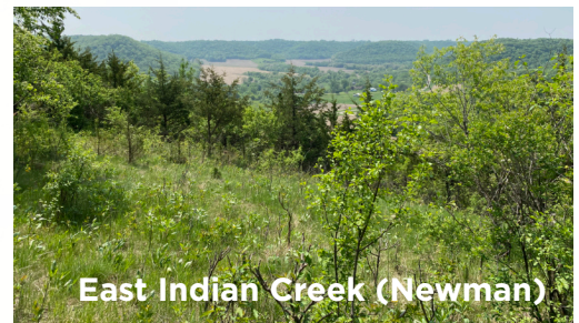
East Indian Creek (Newman)