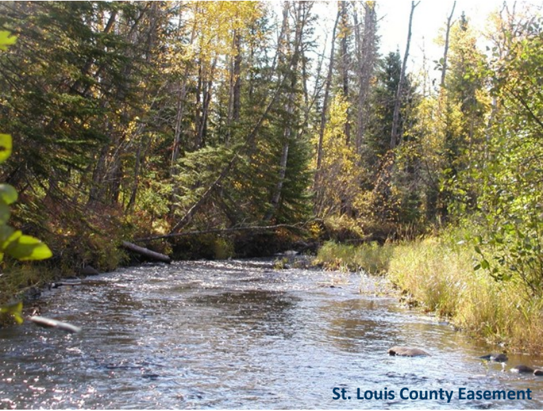
St. Louis County Easement