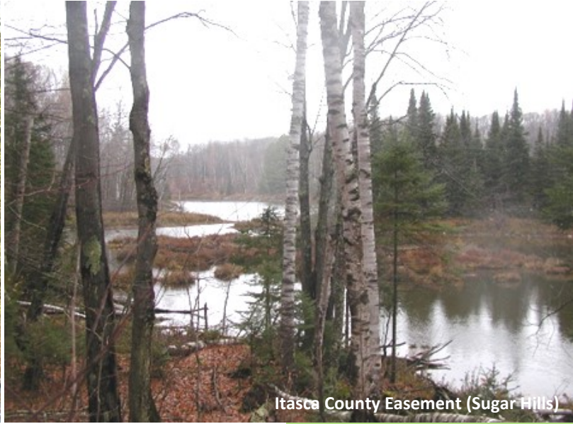
Itasca County Easement (Sugar Hills)

Program Requirements | Easements are customized to the property, but permitted uses allows forest management including timber harvesting and firewood cutting, hunting and fishing, outdoor recreation, maple syrup production, nature observation, and other traditional forest uses. Landowners work with DNR to establish a Forest Stewardship Plan and schedule annual monitoring visits. Easements prohibit forest conversion to industrial, commercial or residential uses or development/subdivision. The easements stay with the property if it is transferred or sold to another landowner.