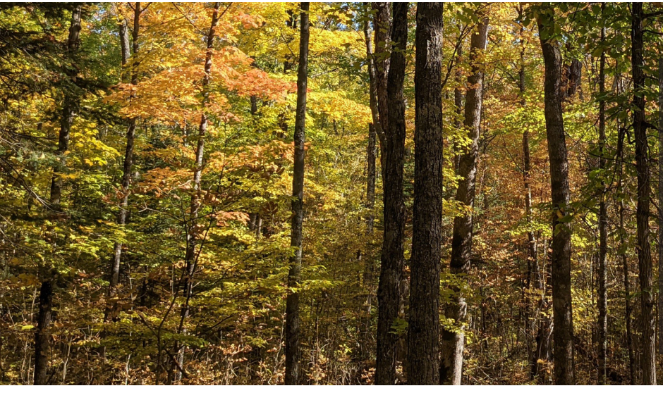
Grindstone Lake (Osprey Wilds South) 460 acres – Protected 2022

The protected habitat includes thriving old-growth forests, restored prairies, wetlands, cattail marshes and shoreline on Grindstone Lake, a Minnesota DNR recognized "Lake of Biological Significance." The conservation easement protects the property from future development and ensures a legacy for Minnesota's youth.