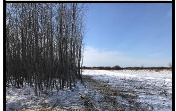
Aspen feathering creating desired habitat diversity