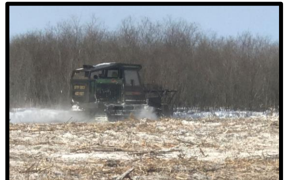
Local contractor mowing brush on the Aitkin WMA