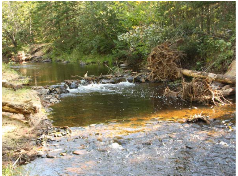
completed rock weir on the Sucker River in St. Louis County