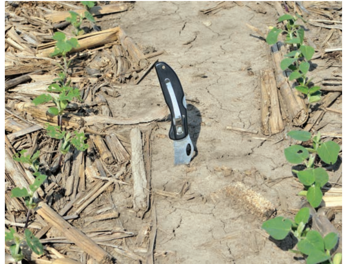
Figure 3. Early-season bean leaf beetle feeding on untreated soybean seedlings (left) and on neonicotinoid seed-treated seedlings (right). This minor feeding does not reduce yield.

The U.S. EPA extensively reviewed published and unpublished data regarding the yield benefits and concluded that “neonicotinoid seed treatments likely provide $0 in benefits to growers” (USEPA 2014).