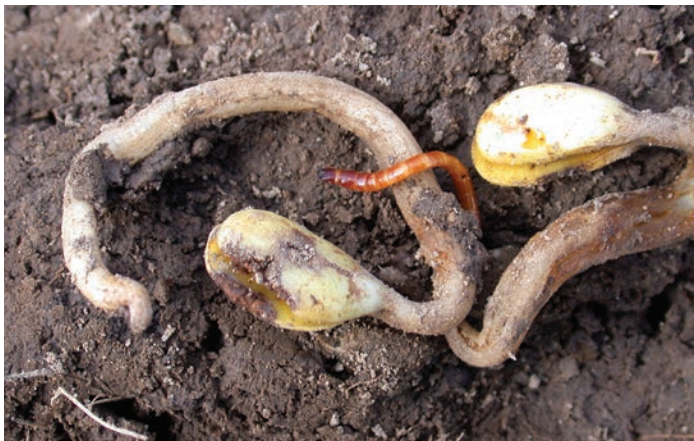
Figure 2. Wireworm feeding seldom reaches economically damaging levels.

These high-risk scenarios are uncommon in northern states. Seed and seedling pests such as wireworms, white grubs, and seedcorn maggots rarely reach economically damaging levels in the vast majority of soybean fields (Figure 2). Adult bean leaf beetles are