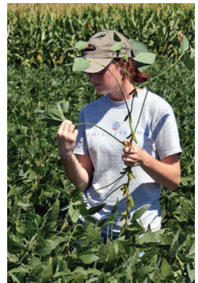
Figure 9. Scouting for insect pests is the tried and true approach.

Growers frequently face limited choices regarding seed treatments. Popular soybean varieties are often offered only with a pre-applied package of seed treatments. Growers who desire untreated soybean seed, or seed treated only with fungicides, should let their seed dealers know as early as possible when ordering seed for the next growing season.