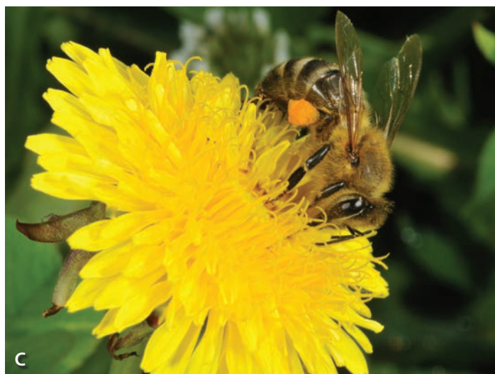
Figure 6. (A) Planter dust generated when planting treated seed contains a very high concentration of neonicotinoids that (B) can move off-target, and (C) potentially harm beneficial organisms.