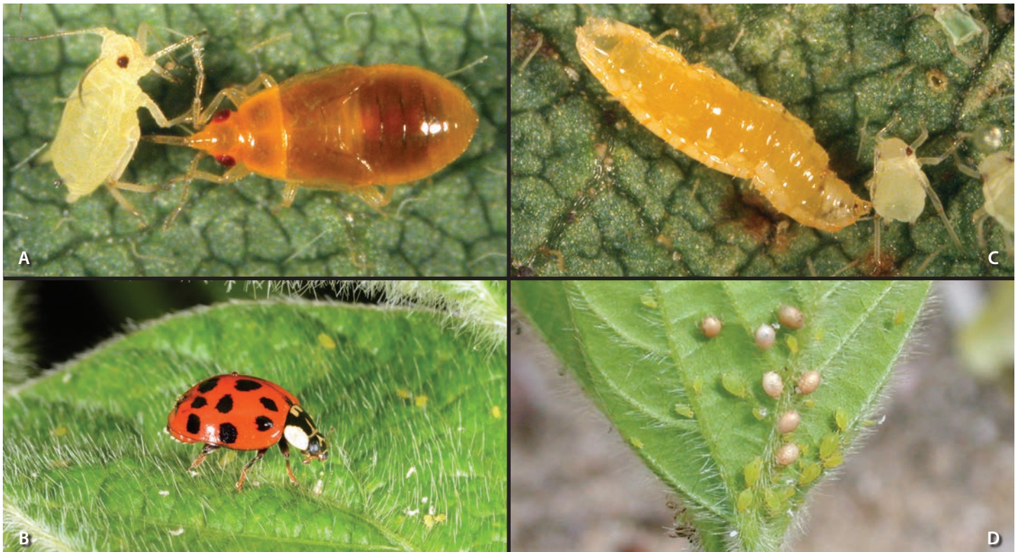
Figure 5. Predators, such as (A) an Orius nymph, (B) Asian lady beetle, (C) aphid midge larva, and (D) parasitic wasps typically suppress early-season infestations of soybean aphid.