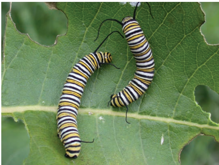
Figure 7. Non-target plants (such as milkweed) can absorb neonicotinoid residues and affect non-target insects (such as monarch butterfly caterpillars).

The same study demonstrated that in slug-infested fields, soybean grown without neonicotinoid seed treatments produced higher plant populations and yields than their treated counterparts. This study has important management implications, since slugs are emerging as a key pest in no-till cropping systems in many parts of the northern soybean production region.