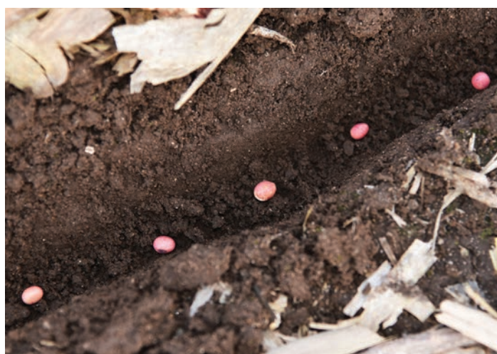
Figure 1. Neonicotinoid-treated soybean seed before soil covering.

This publication reviews the current research regarding the efficacy of these neonicotinoid seed treatments, their non-target effects, and the potential role for neonicotinoid seed treatments in soybean production.