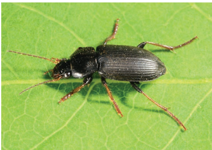
Figure 8. Ground beetles typically control slug populations. But slugs that feed on plants grown from neonicotinoid-treated seeds can pass the insecticide to the beetles.