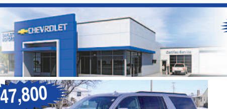
#12277U '13 CHEVY EQUINOX LTZ in Crystal Red with Heated Leather Seating, Chrome Package and Lots More with 63,000 Miles on this All Wheel Drive

800-446-OSLO (6756) • dahlstrommotors.com • 301 Main Street, Oslo, MN • Hours: Mon-Fri 8 a.m. - 5:30 p.m. & Sat 8 a.m. - 3 p.m.