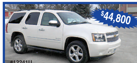
#12241U '14 CHEVY TAHOE LTZ Diamond White with Cocoa Dune Leather Seating, 2nd Row Buckets and Much More with 44,000 Miles on this Local Trade.

Kittson County Enterprise 118 2nd St. S PO Box 730 Hallock, MN 56728 Phone: 218-843-2888 Fax: 218-853-2888 Email: kce@wiktel.com Website: kittsonarea.com facebook.com/KCoEnterprise