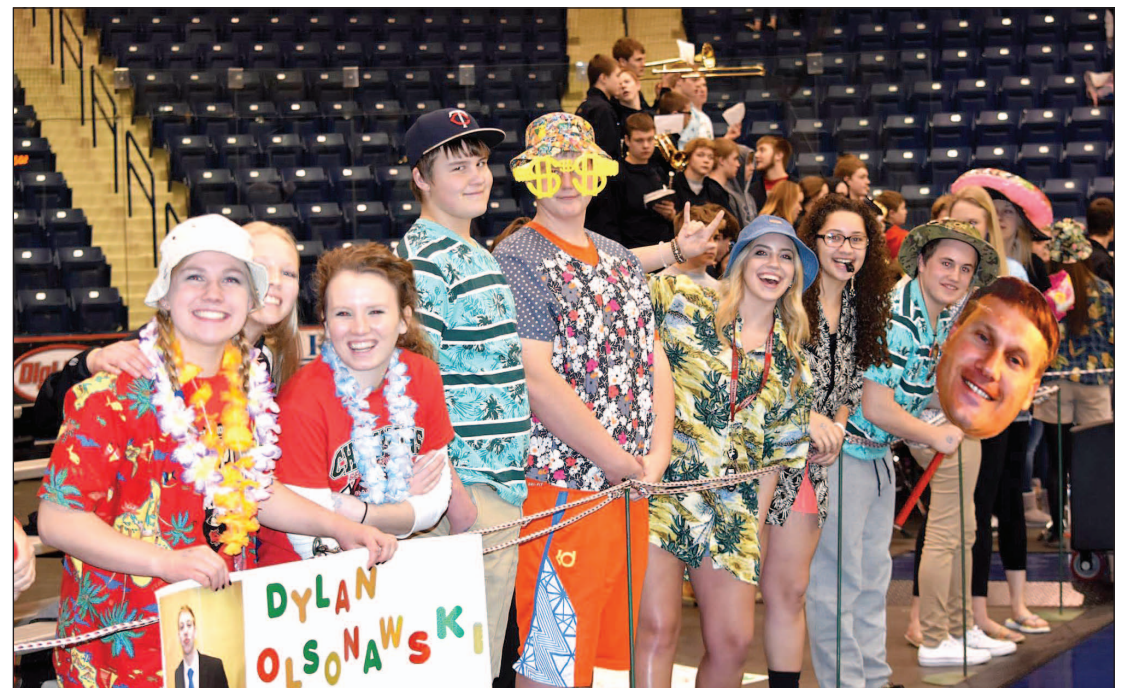
BEARCAT FANS WERE ALL DRESSED UP to help support their boys basketball team during playoffs last week. Signs and pictures of the players and coaches were held up during the game. The boys will play Monday, Feb. 29 versus Northern Freeze. We will have details of that came in next week's issue.

emergency first responders. Continued training and cooperation between agencies is necessary to ensure disaster situations will be minimized.