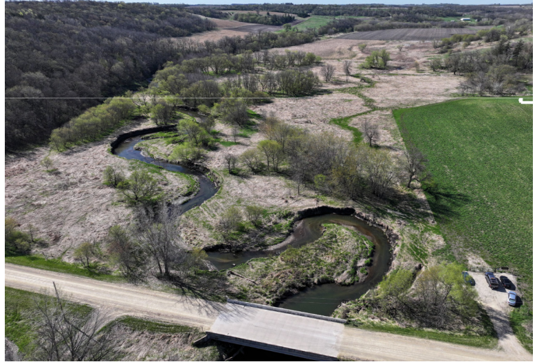
Photo (right): Aerial view of the Little Cannon River Aquatic Management Area

In a region where healthy coldwater streams are increasingly rare, this project will restore up to 5 miles of the Little Cannon River and its surrounding riparian corridor—delivering enduring habitat benefits for fish, wildlife, and people. Located in a high-priority conservation area, this work is tailored to stabilize the river, reduce erosion, and reconnect land and water.