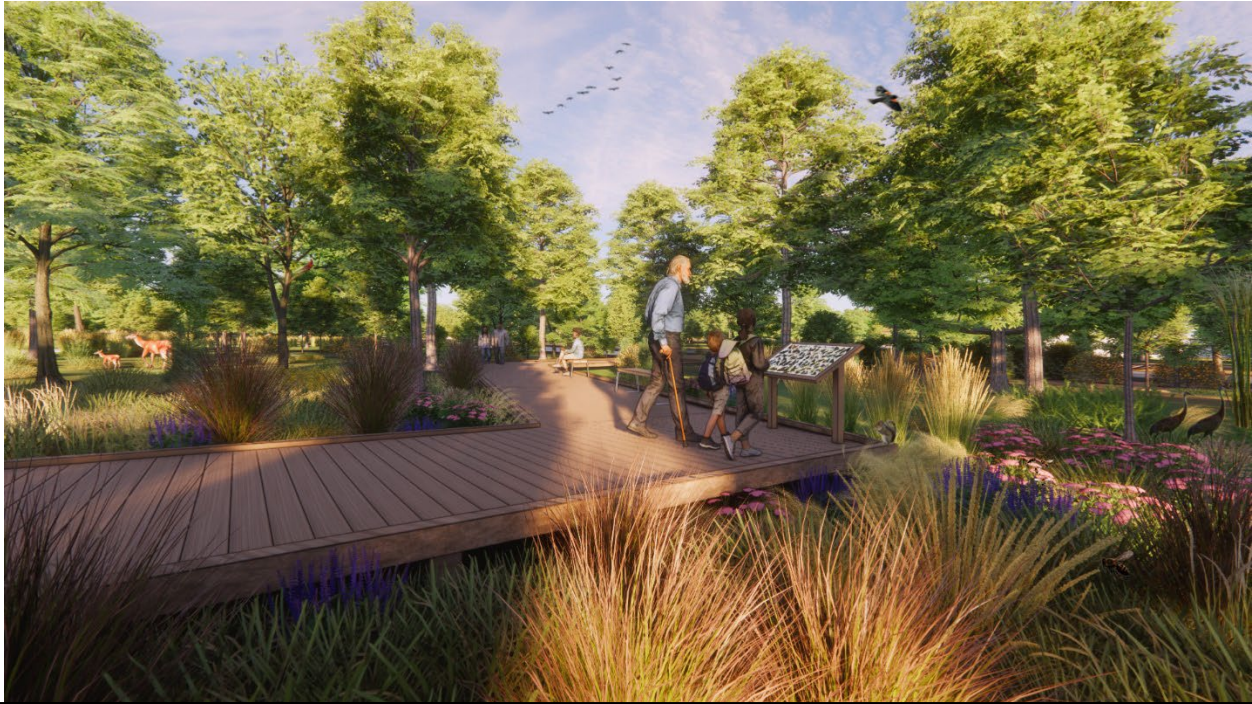
An artist's rendering of adults and children visiting a boardwalk within a thriving wetland near Agate Bay that provides habitat to many animals.

Lake County Soil and Water Conservation District (Lake SWCD) is partnering with the City of Two Harbors (City) to implement the goals in the Agate Bay Waterfront Development Plan . The Plan arose when the State conveyed 20 acres of Lake Superior waterfront property to the City, making it possible to undertake waterfront revitalization activities. Lake County SWCD requests funds to complete engineering and design plans for the wetlands on the Agate Bay property by 2029 to enhance degraded coastal wetland habitat , protect water quality in Agate Bay (which is impaired for aquatic recreation), and improve public access to greenspace. A complex of depressional coastal wetlands exists on site, supporting wet meadow, shrub-carr and forested wetland plant communities, but they are degraded due to past industrial activity. . They have altered hydrology and low biodiversity. Much of the plant community consists of invasive plants and shrubs, creating low-quality habitat. There are very few natural coastal wetlands along the shore of Lake County, due to steep bedrock lining most of the County's Lake Superior coast. Agate Bay is unique for its flat topography and coastal wetlands in a publicly accessible setting.