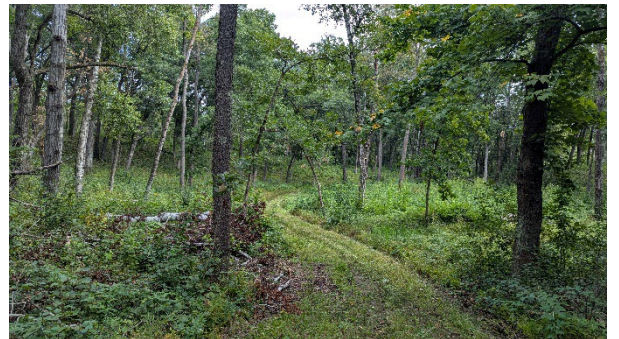
Successful buckthorn removal in a metro-area woodland followed by reseeding .

Project by: Friends of Sunfish Lake Park