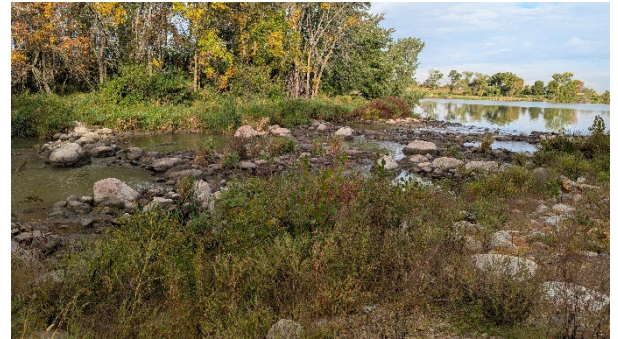
A system of rapids one year after installation as an improvement to an outlet on Lime Lake.

We will accomplish this by continuing the popular New Applicant CPL Round, continuing outreach efforts to unserved and underserved conservation partners, and maintaining CPL staffing to help achieve program expansion goals.