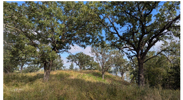
A mature oak savanna thriving following invasive species removal and prescribed burning.