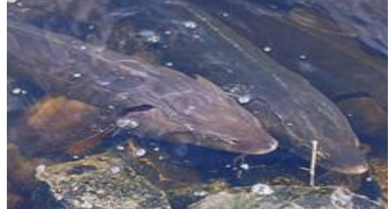
2 Lake Sturgeon