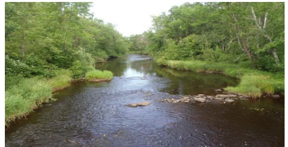
1 Example of Kettle River where biological communities are excellent. The fish scored far about the exceptional use threshold and the macroinvertebrates also scored beyond their exceptional use threshold here.