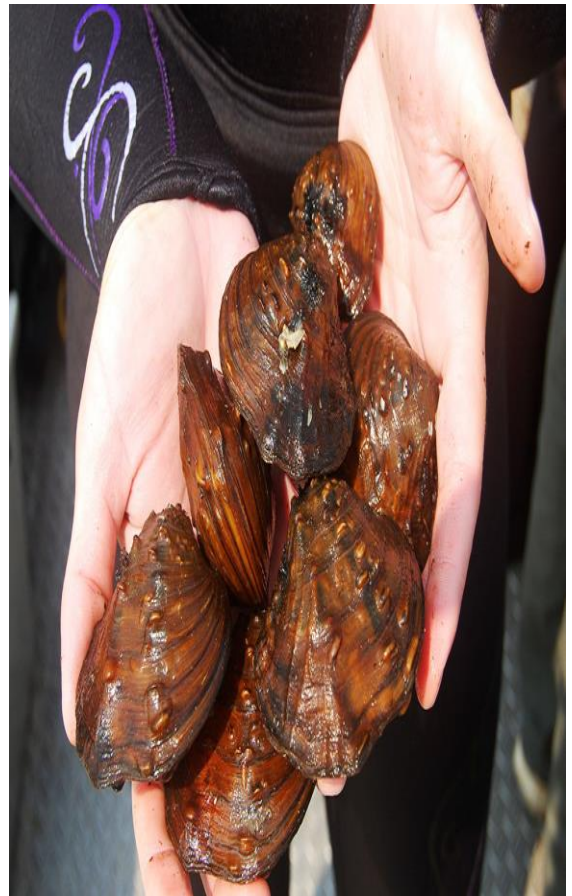
4 Endangered winged maple leaf mussels.