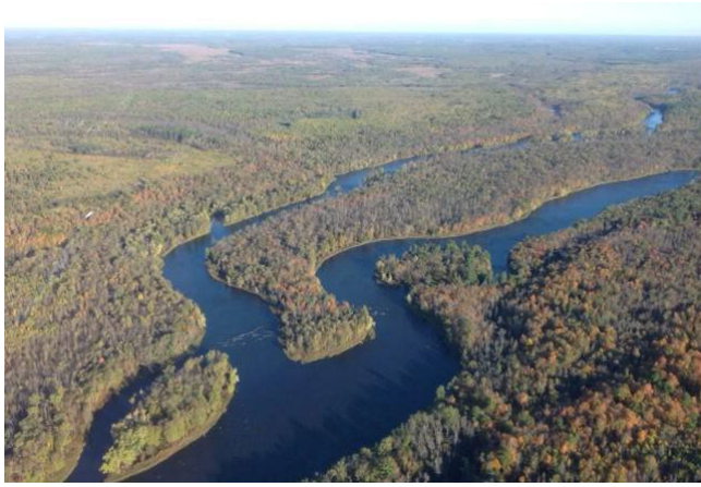
6 Confluence of the Kettle and St. Croix Rivers