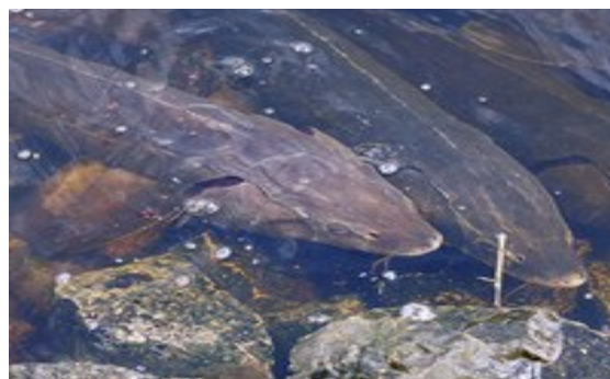
2 Lake Sturgeon

1 Example of Kettle River where biological communities are excellent. The fish scored far about the exceptional use threshold and the macroinvertebrates also scored beyond their exceptional use threshold here.