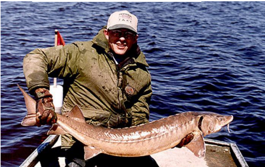
3 A lake sturgeon caught while fishing on the Kettle River. They make a quality catch and release species for anglers. The Kettle and Snake Rivers are one of the few rivers in Minnesota with lake sturgeon.