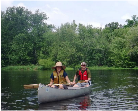
5 Paddlers enjoying the Kettle River. Both the Kettle and Snake Rivers are state water trails and the Kettle in Pine County is a state wild and scenic river.