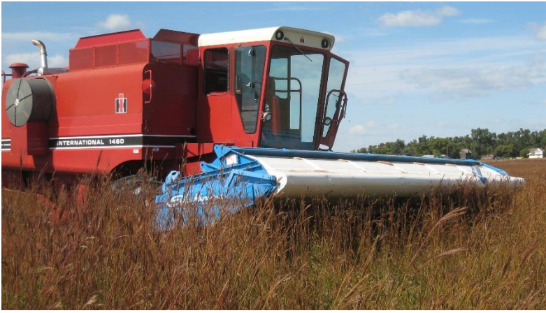
Local contractors help agency staff collect large volumes of local ecotype seed from the prairie.