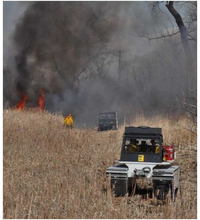
Roving crews and their specialized equipment have dramatically increased our capacity for habitat enhancement.