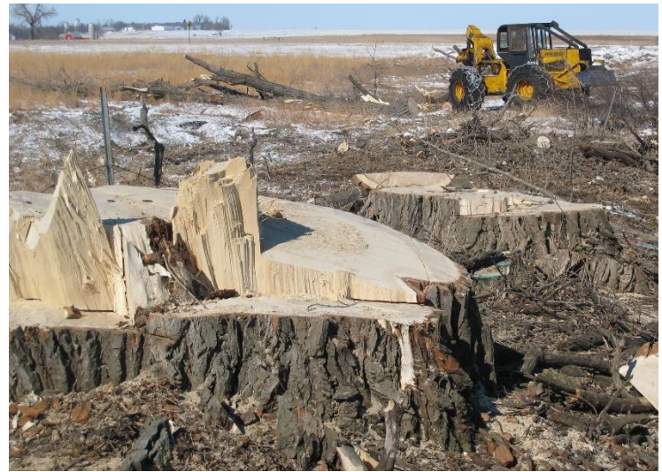
When trees get too large, they must be removed mechanically.