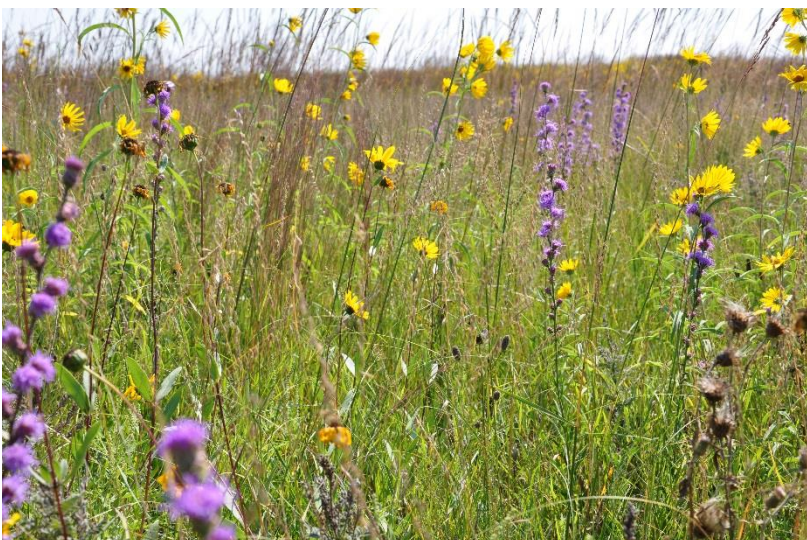
The FINAL PRODUCT, a diverse stand of local ecotype plants providing nesting cover for wildlife as well as nectar and pollen for pollinators.