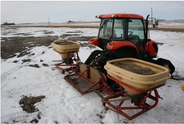
Snowseeding the mix of dozens of grasses and wildflower seed.