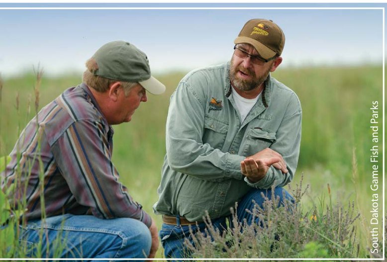
South Dakota Game Fish and Parks

The newly developed Habitat Pays website is a great resource for the farmers and ranchers of South Dakota. Videos on the site feature stories of landowners in various parts of the state who have taken advantage of programs to maintain or establish habitat. The site includes a comprehensive list of resources, along with a list of habitat advisors who are experts in conservation programs and habitat planning. They possess the knowledge of federal, state, and local programs to assist landowners in finding the right program or programs to meet their personal habitat and land use goals. Habitat advisors are available to assist landowners in designing, developing and funding habitat improvements on private lands. Background information, images and contact information for each of the habitat advisors is available on the website so landowners can put a name and a face together.