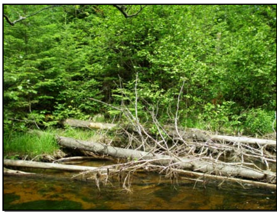
Figure 3. Wood structure in a stream.

An important component of fish habitat in upper-Midwest streams and lakes is wood structure, which is created naturally by stream bank or shoreline trees that fall into the water. In streams, wood structure provides cover and creates pools used by trout and other fish. It also collects fine sediment, allowing cleaner gravel areas downstream where fish will spawn (Figure 3). In lakes, single downed trees provide cover and spawning habitat for fish such as small mouth and largemouth bass. Also, submerged wood moved by waves and currents in a lake can become clustered and form complex structures upon which algae and small aquatic insects attach. These in turn become a food source for small fish such as black crappie, yellow perch and bluegill, which use the structure for forage, cover, and spawning (Figure 4).