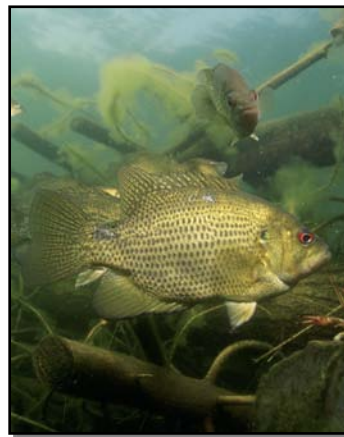
Figure 4. Rock bass using wood structure in a lake.

Proposed Action: To improve the habitat in the Shell Rock River we propose to increase large woody debris by cutting and dropping selected streamside trees into these streams at a rate of 5 to 10 trees per half mile. The channel between Fountain and Albert Lea lakes will be treated. The cutting and placing of these selected trees would be conducted so as to look as natural as possible and to maintain riparian and stream tree canopy cover. To increase the habitat benefit and prevent the woody debris from blocking the stream channels, the trees may need to be winched into place with a manual or chainsaw winch.